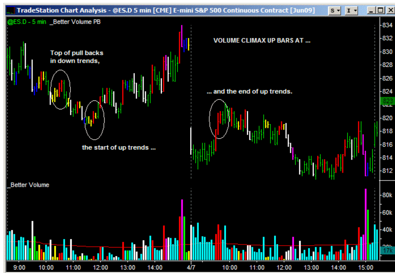
Better Volume Indicator: Volume Climax Up (Emini 5 min)

Volume Climax Up bars are identified by multiplying buying volume (transacted at the ask) with range and then looking for the highest value in the last 20 bars (default setting). Volume Climax Up bars indicate large volume demand that results in bidding up prices. The default setting is to color the bars red.