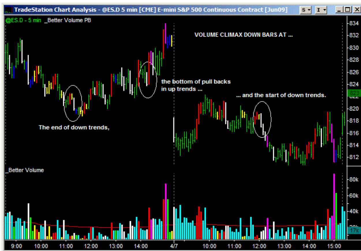
Better Volume Indicator: Volume Climax Down (Emini 5 min)

Volume Climax Down bars are essentially the inverse of Volume Climax Up bars.