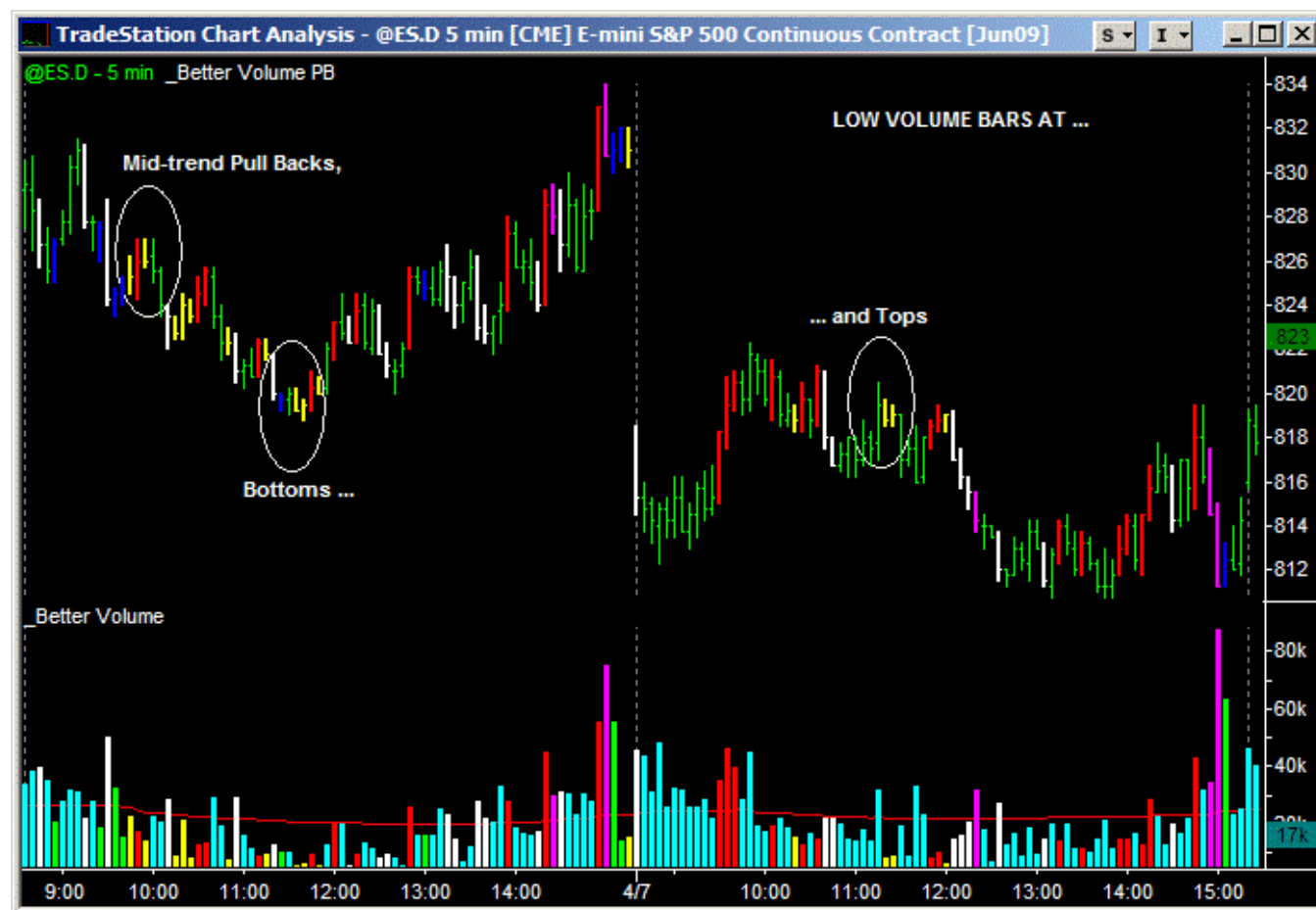
Better Volume Indicator: Low Volume (Emini 5 min)

Low Volume bars are identified by looking for the lowest volume in the last 20 bars (default setting). Low Volume bars indicate a lack of demand at tops or a lack of supply at bottoms. The default setting is to color the bars yellow.