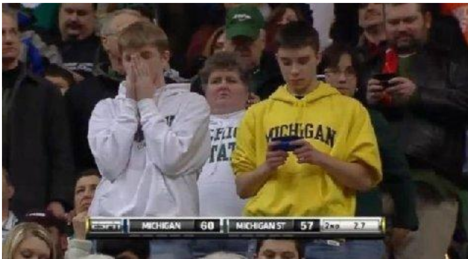
Having fun with the girlfriend...